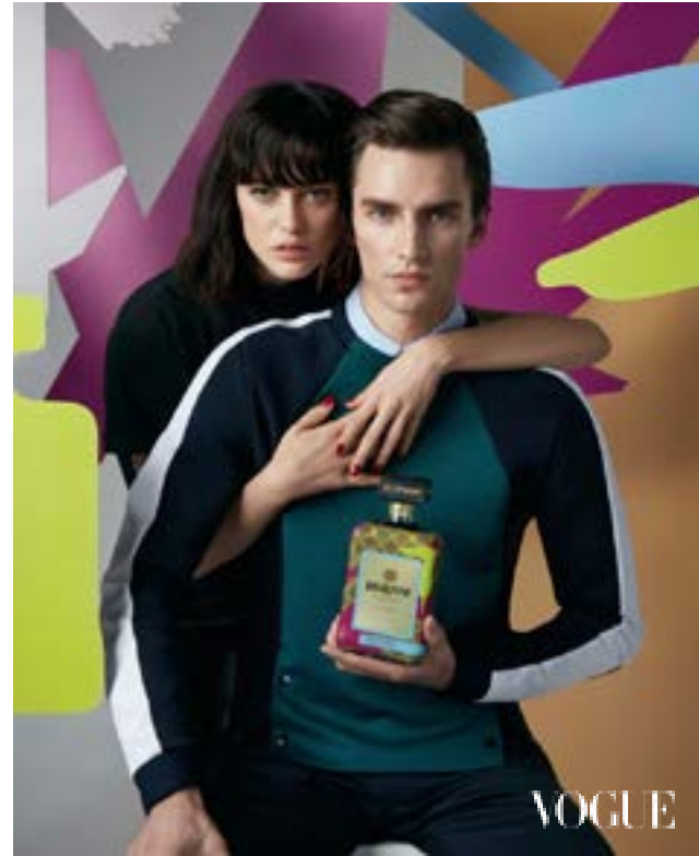
Art Direction VOGUE Editorials