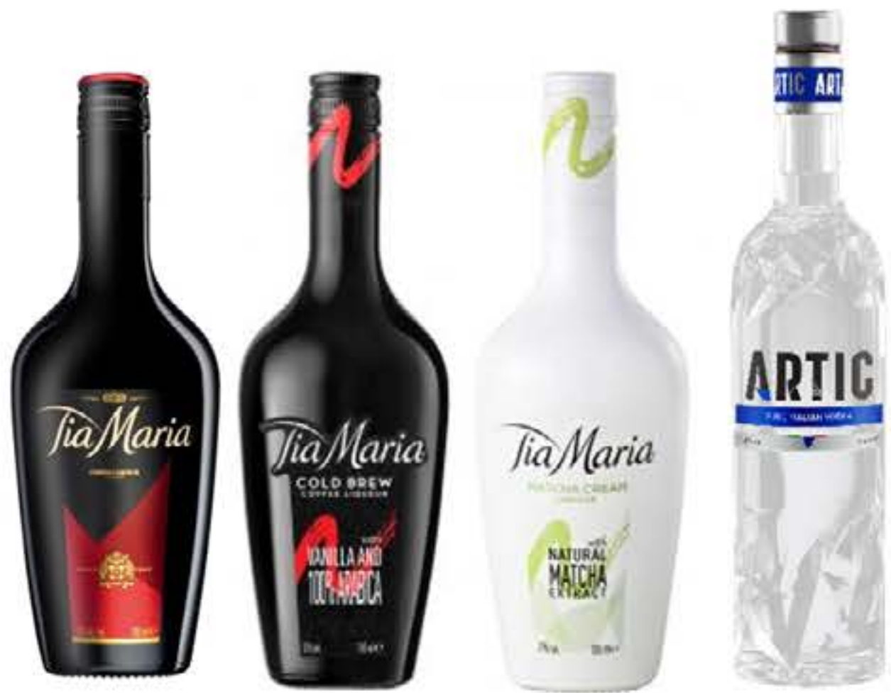
Restyling (both glass & label creation)