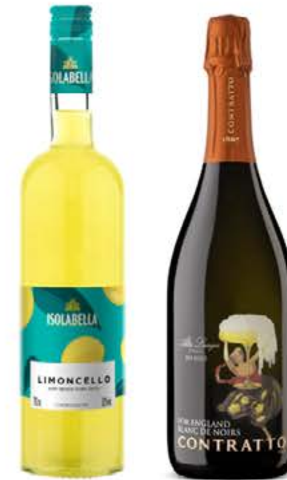
restyling (of the all brand family)