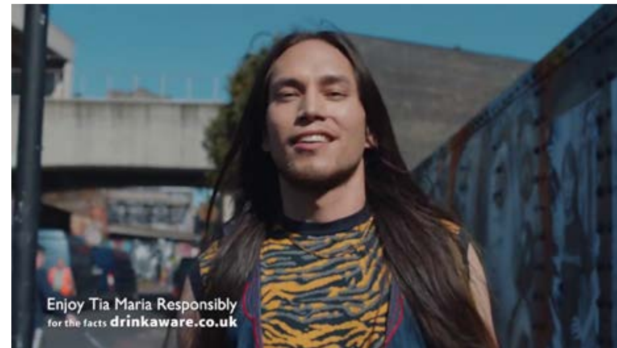
Art Direction Supervision Tia Maria One of a Kind TVC