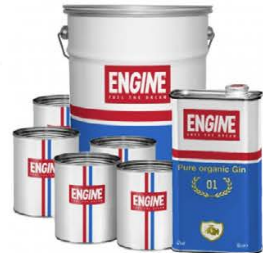
new product creation(patented)