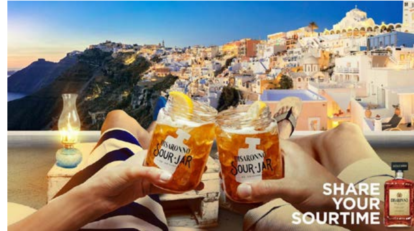
Art Direction Disaronno Sour Digital Campaign