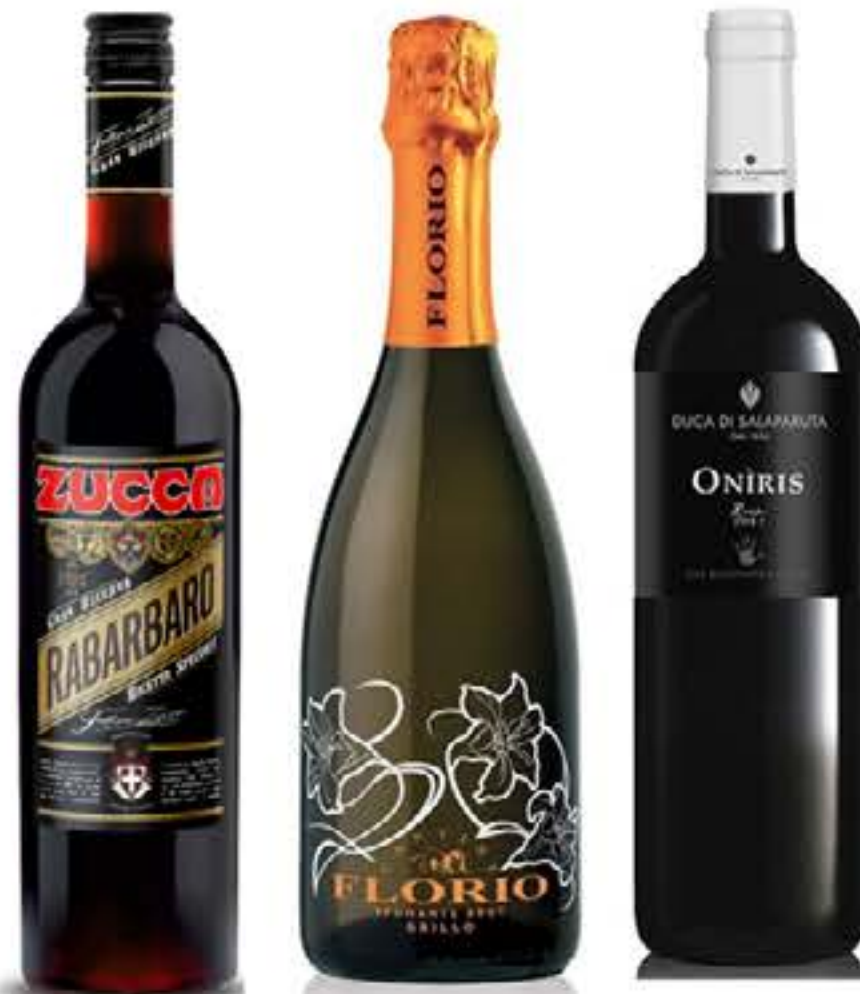
new product creation