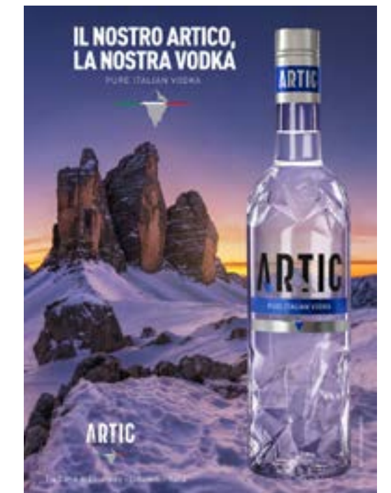
Art Direction & Execution Artich Vodka Campaign