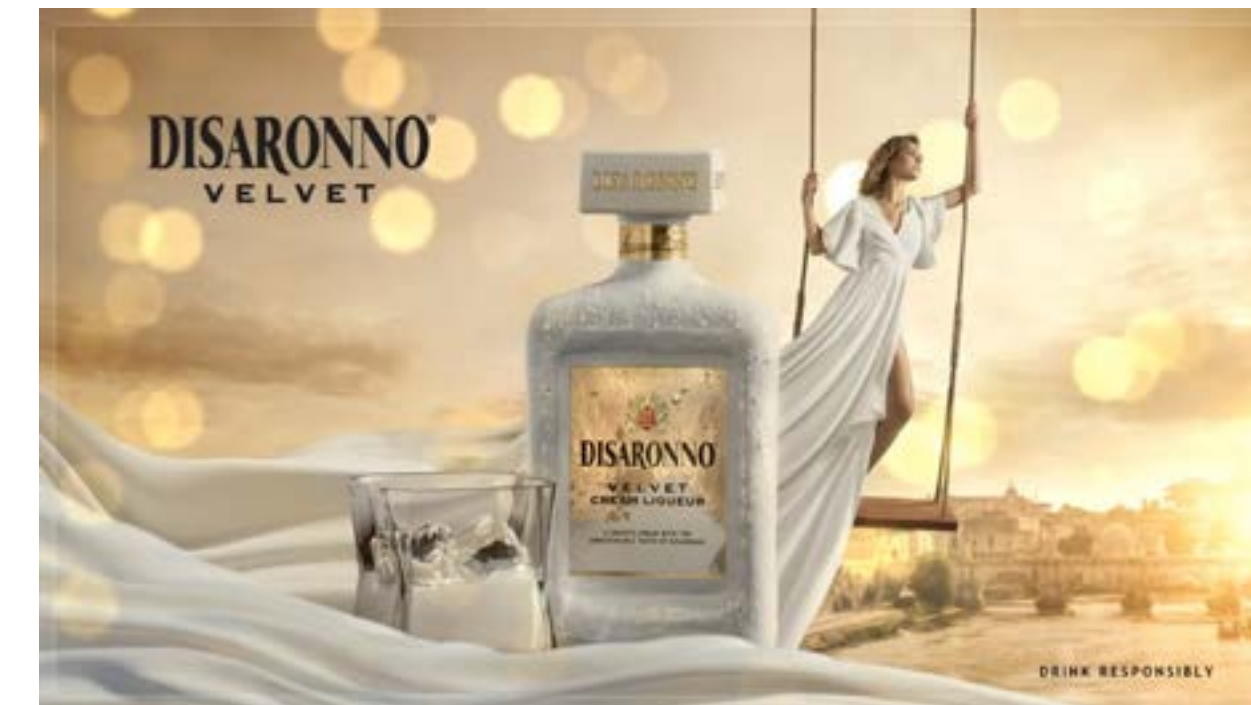
Art Direction Supervision Disaronno Velvet Digital Campaign