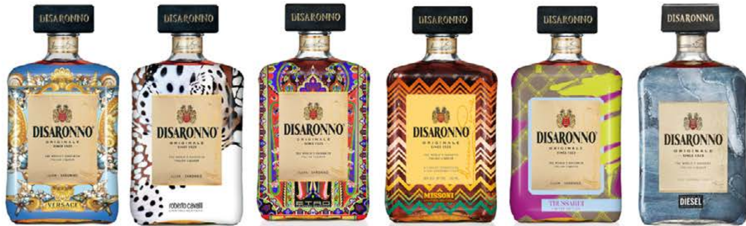
Minion range for the ICON project: creation of design approved by the stylist