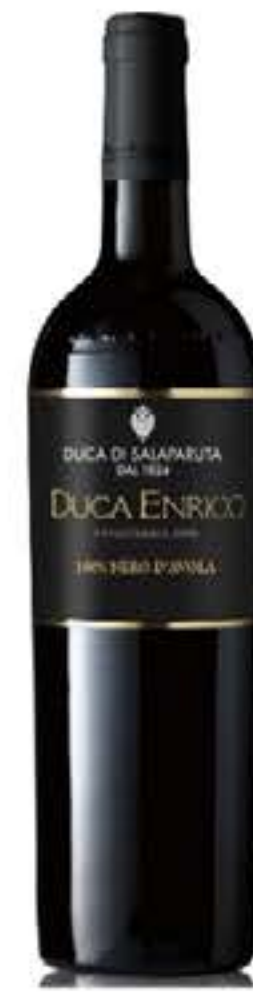
restyling for Chinese market (all brand family)