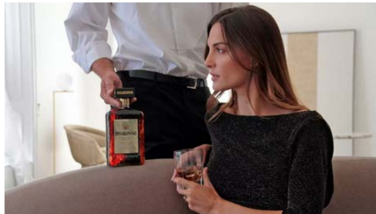
Art Direction Supervision Disaronno TVC