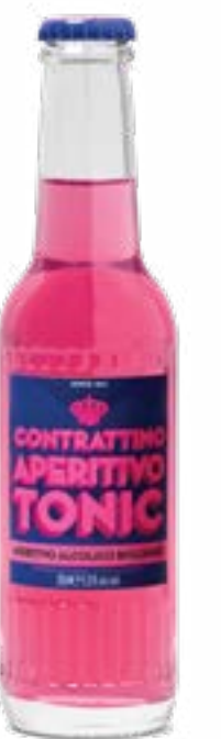
new product creation