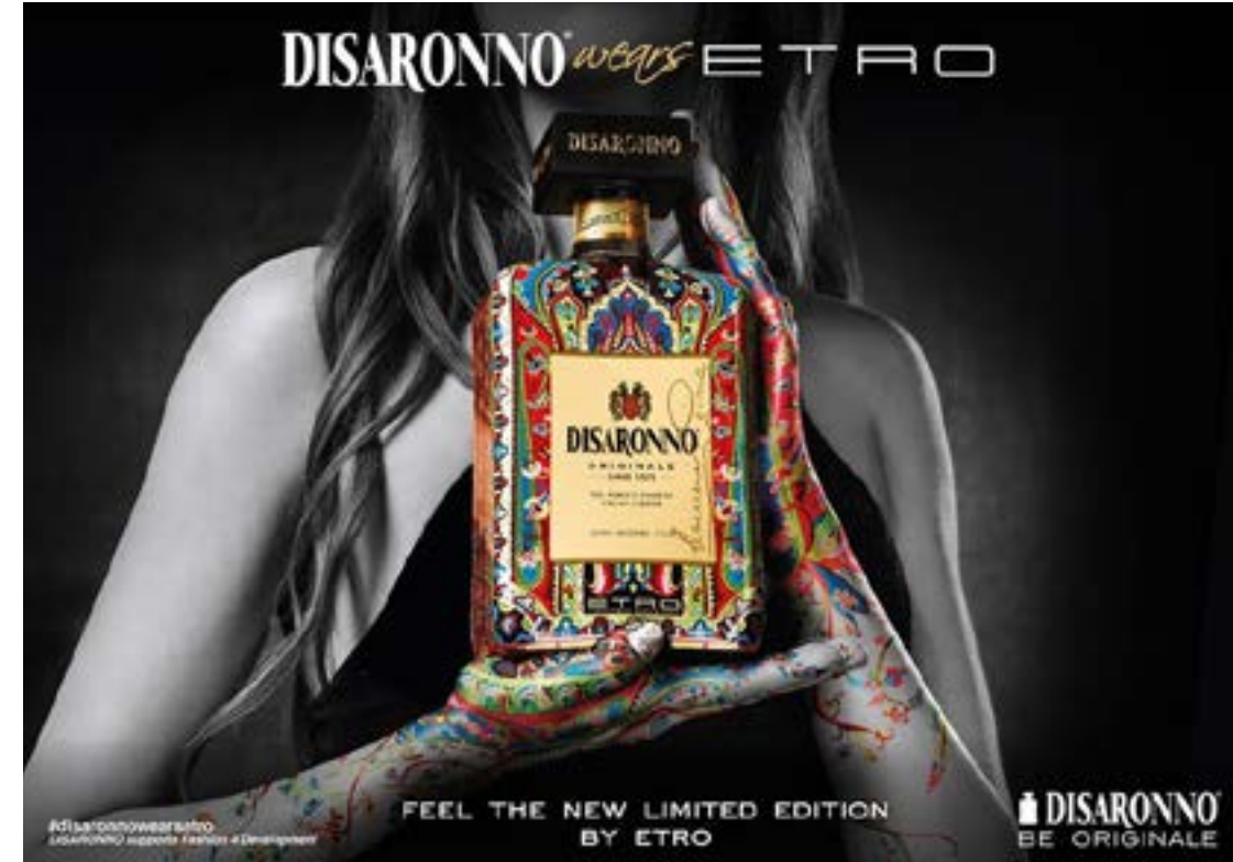
Conception & Art direction Disaronno wears Etro TVC